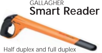
GALLAGHER Smart Reader