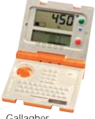
Gallagher Smart Scale® mobile Reader included Software

Used globally, the LiveTrack® reader is the most advanced and affordable ISO livestock hand held wand reader. With a memory of up to 10,000 RFID tags, it improves performance and lowers overhead while processing livestock in the field. Conceived with the help of cattlemen and other livestock professionals the LiveTrack® reader is robust and easy to use, making it an ideal solution for producers, transporters, feedlots, auction houses, sales yards and veterinarians.